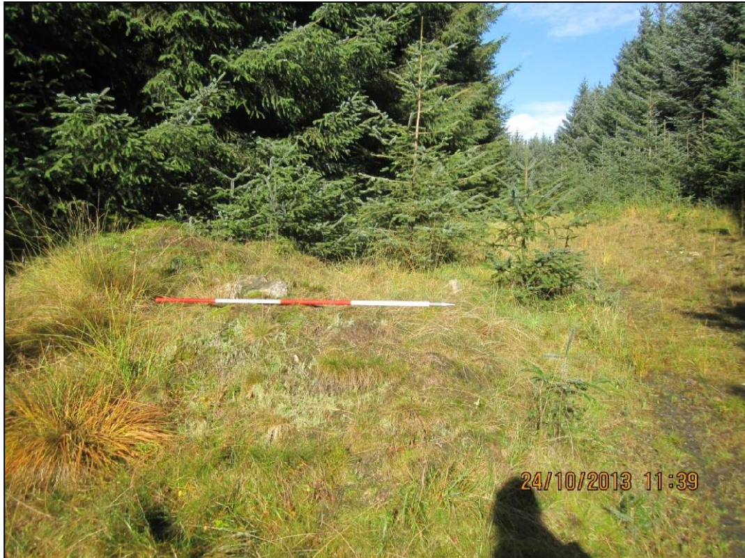
Plate 3: Previously unknown feature identified during site walkover (U3)