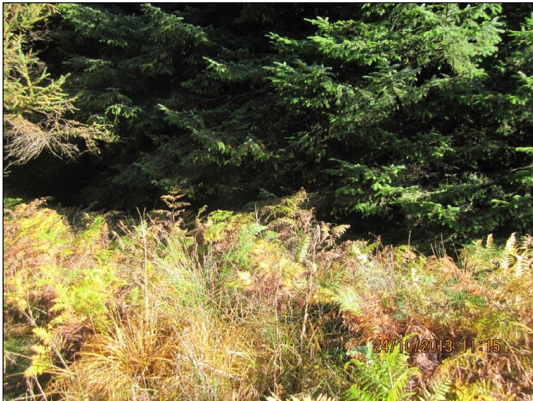
Plate 1: General View of site