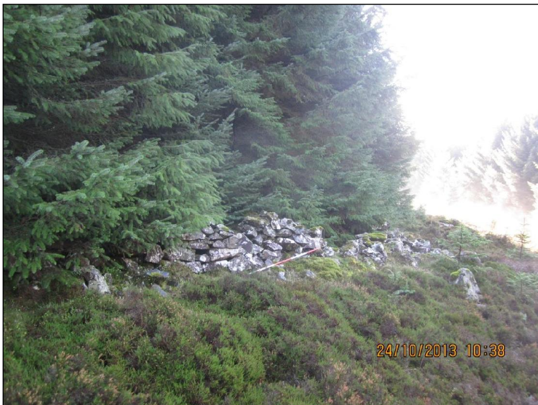
Plate 2: Sheepfold (MDG25437)