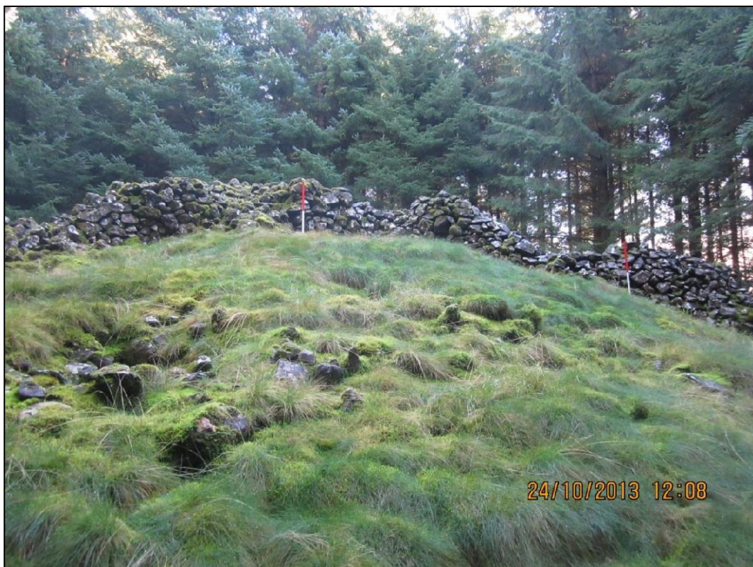
Plate 6: View of Craigengillan Cairn (SM2238). Note the Sheepfold crossing the cairn (U3).