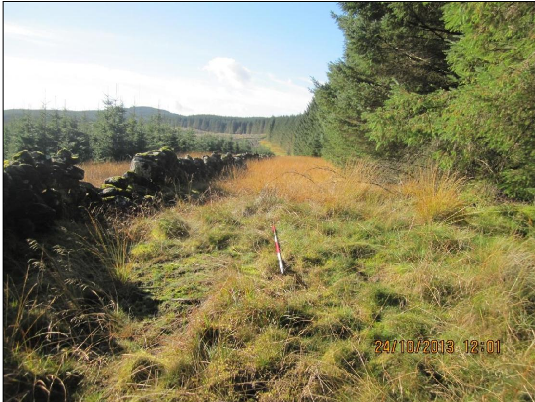
Plate 5: A collection of stones immediately east of Craigengillan Cairn, potentially from a drystone wall, potentially older feature (U2).