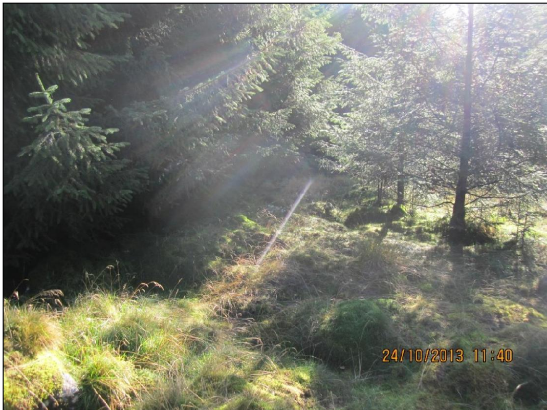
Plate 4: General view of potential earthworks (MDG3930)