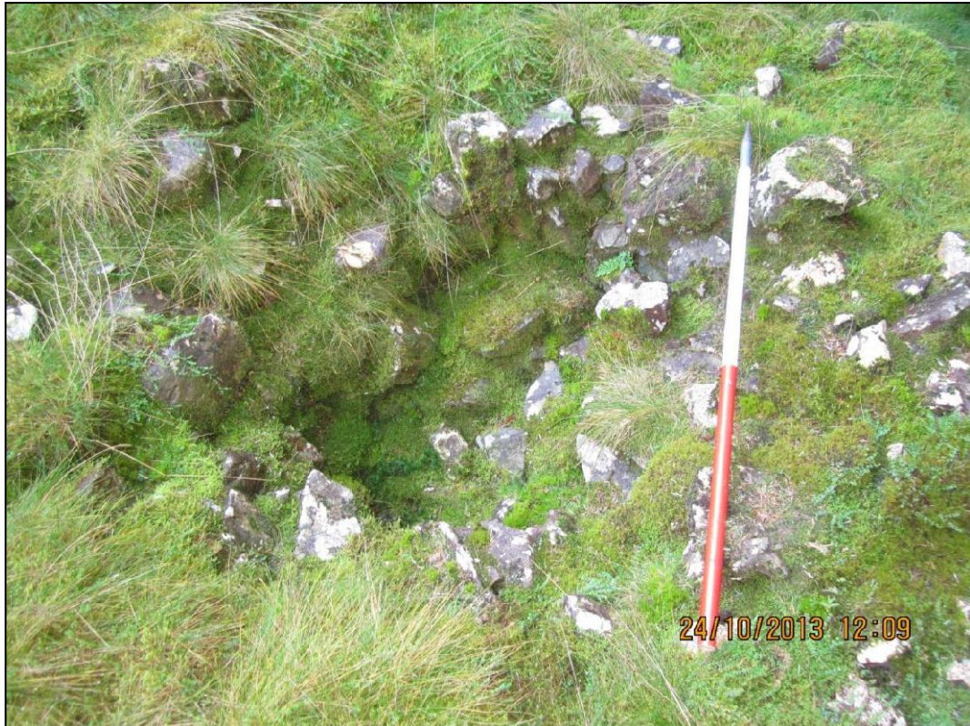
Plate 7: Detail view of Craigengillan Cairn (SM2238), showing construction.